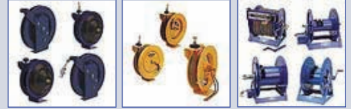
Electric Cord & Cable